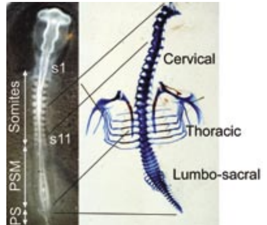
Figure 1: Vertebrae derive from embryonic somites. This sequence illustrates the head-to-tail vertebral development of a chicken. The two-day-old embryo (left) has 11 somites. The black lines indicate the position of those somites on the ten-day old embryo (right) with a fully developed skeleton. The five most anterior somites are incorporated into the skull (not shown on the right panel).

"This is an area of research that I find intriguing," says Dr. Pourquié. "I am looking forward to continuing the search for new answers to questions, and new questions to answer." 🌱