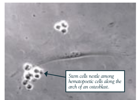
Figure 1: Image of osteoblast niche for hematopoietic stem cells forming in lab culture. Certain osteoblasts elongate, forming a smooth arch on one edge and a jagged shape, like a bone cavity, on the other edge. The stem cells nestle in the arch.

“With this award, we can undertake additional experiments that might lead to something very important,” he says. “The ultimate goal of studying and characterizing the intestinal stem cells is to be able to regenerate the intestine and to develop potential treatments for colon cancer, ulcers, or other intestinal diseases.”